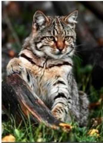
Pictured: A European wildcat.