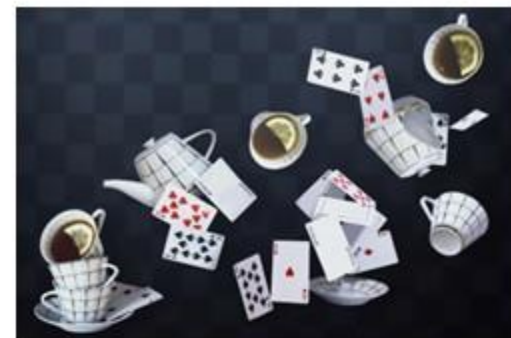
Pictured: Playing cards a plenty at the Mad Hatter's Tea Party!

Before her musical career, Sabrina was in many TV shows and starred in her first role aged 11. We don't yet know which character she will play, but many people think it could be something magical. The story of Alice in Wonderland was written by Lewis Carroll in 1865. It's all about a girl who falls down a rabbit hole, and