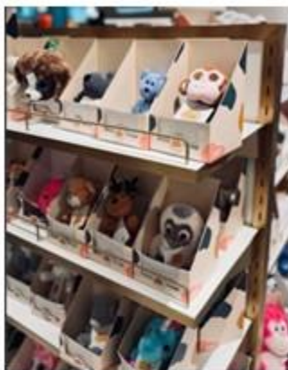
Pictured: The Loved Before teddies in Selfridges, London.

Loved Before helps cuddly toys find a new home. People can donate teddies they no longer need, and each one is washed, brushed, and made ready for a brand-new adventure. Every toy comes with a little story card, so you can learn about the life it had before! You can spot these pre-loved teddies in some UK shops, such as Selfridges and Fenwick, and also in Bloomingdale's in the United States. There are more stores