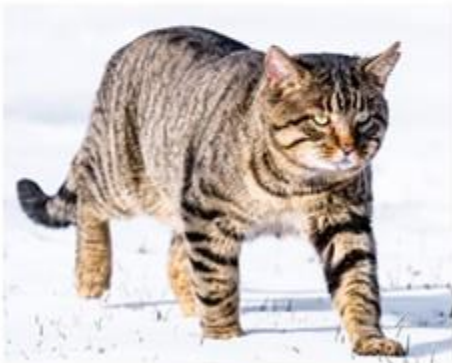
Pictured: A European wildcat.

Do you think we should try to help all critically endangered animals?